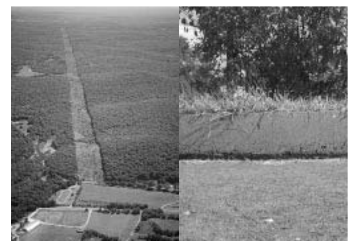
Figure 1: What constitutes fragmentation is highly species-dependent. A power line may be a barrier to forest birds, while a salamander's eye view of fragmentation might be a simple road curb.

Fragmentation also affects large mammal and bird species. Large predators needing sizeable hunting ranges, like bears, bobcats, and owls, seem most affected. Some species are so adaptable to human landscapes that they make generalizations hard to make; for instance, deer populations in southern New England are at record highs. Even this gain may be connected to fragmentation, since most experts believe that the deer explosion is due, in part, to the absence of large predators (including hunters). Fragmentation can also directly affect human health; for instance, most experts believe that Lyme disease, carried